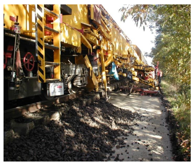
Encase of cleaned railroad balast after cleaning path

Backers Maschinenbau GmbH Tel. +49 (0)59 36 / 93 67-0 www.backers.de