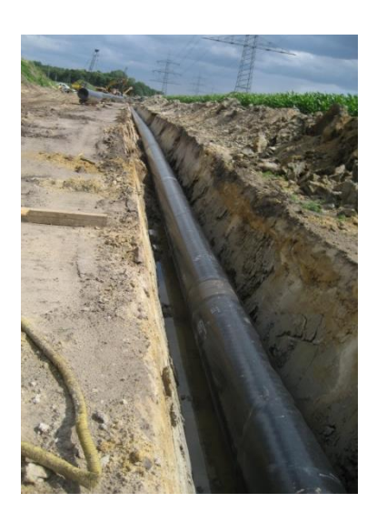
Direct backfill of the screened out finesize into the shaft of utility line