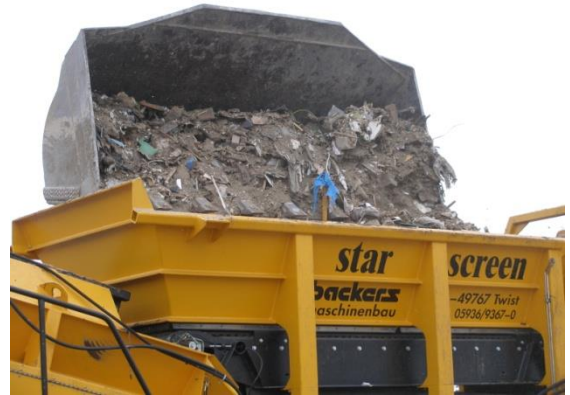
Excavator-loading into the 3-fraction starscreen 3-mtb