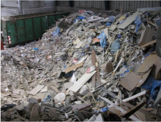
Material in its original state by delivery

Application: buildingsite rubbish (pre-shredded) / landfill