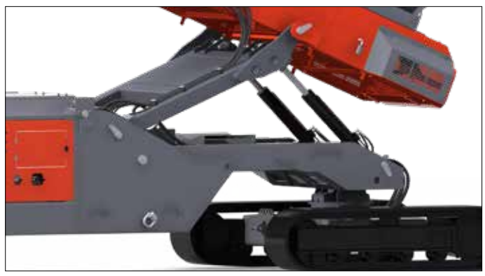
Hydraulic Feed Adjust