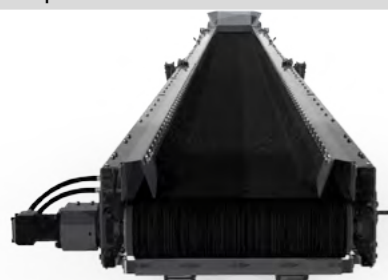
Full Length Conveyor Skirting