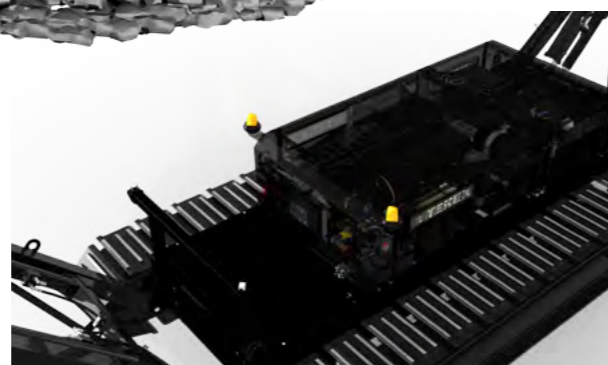
Deutz D2011 36.4kW(49hp) Engine