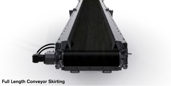
Full Length Conveyor Skirting